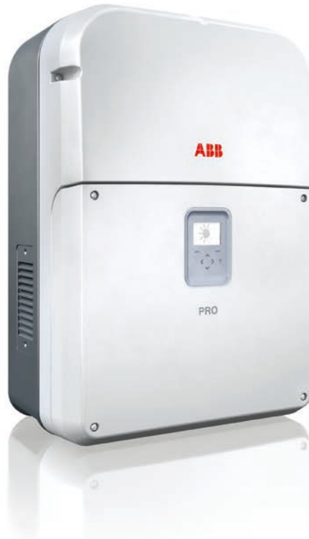
ABB string inverters cost-efficiently convert the direct current (DC) generated by solar modules into high quality three-phase alternating current (AC) that can be fed into the power distribution network (ie grid). Designed to meet the needs of the entire supply chain – from system integrators and installers to end users – these transformerless, three-phase inverters are designed for decentralized photovoltaic (PV) systems installed in commercial and industrial systems up to megawatt (MW) sizes.