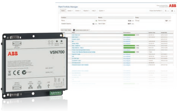
VSN700 Data Logger and web user interface